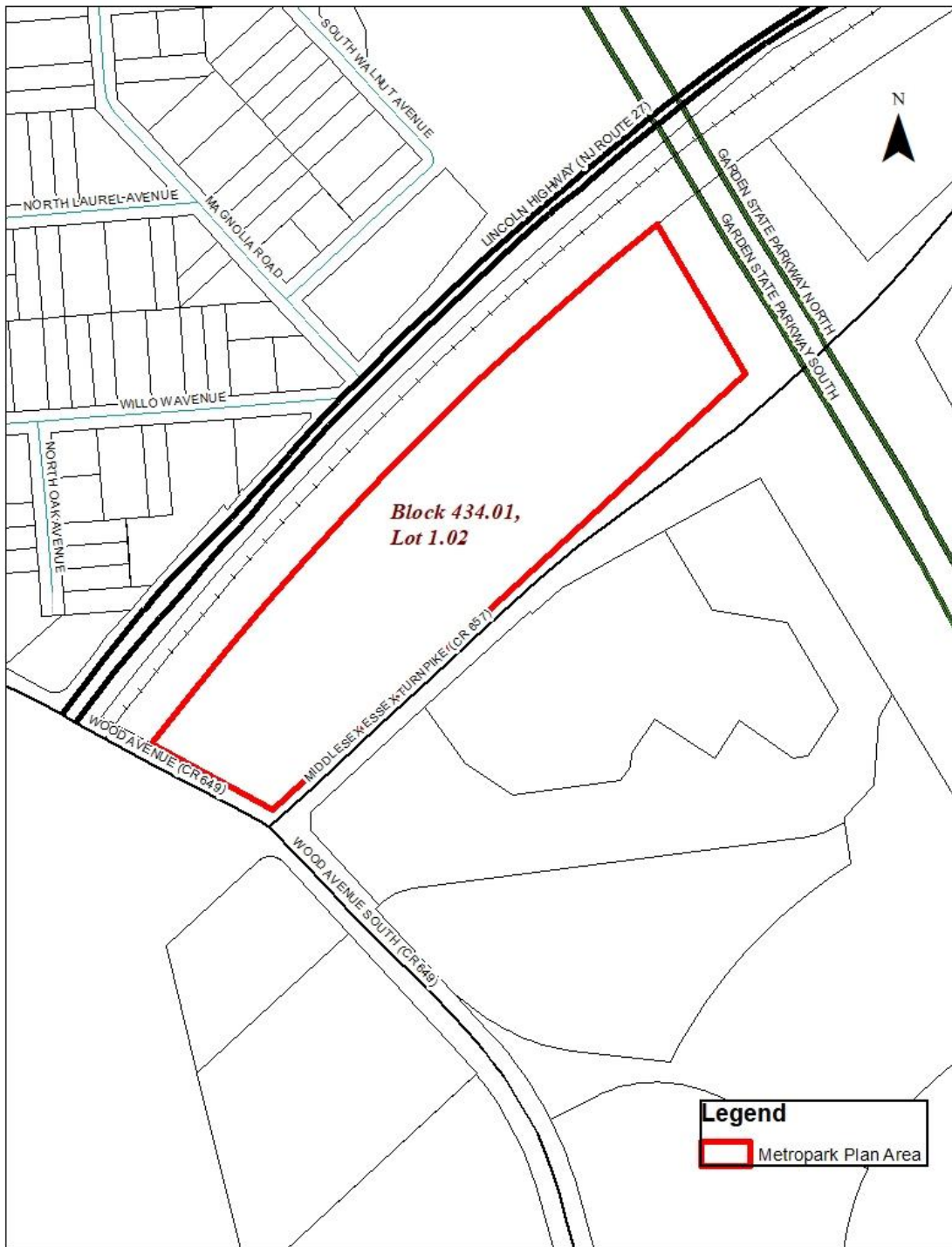
Figure 1: Parcel Map