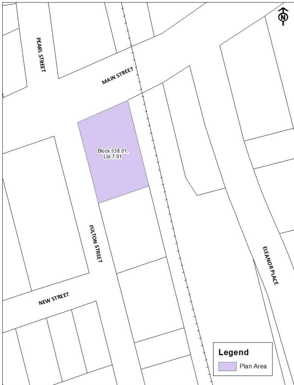
Figure 1: Downtown Woodbridge, Area 5 Parcel Map