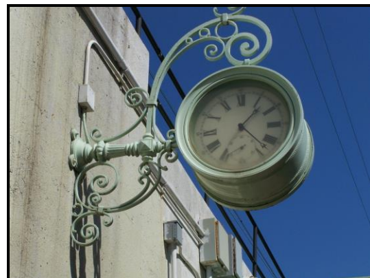
Decorative Clock at Train Station