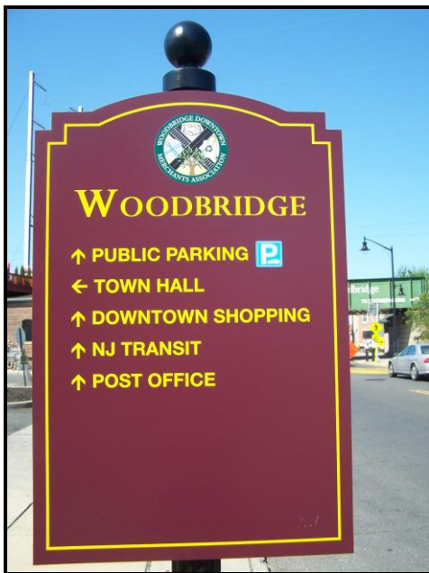
Wayfinding Sign on Main Street