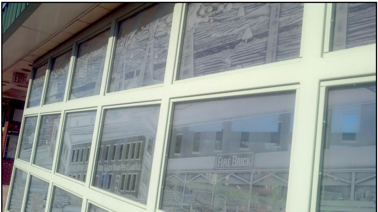
Window Etchings at the Woodbridge Train Station Illustrating the Township's Industrial Past

The Township of Woodbridge is the first incorporated township in the state of New Jersey. The Woodbridge proper section of Woodbridge Township is one of the earliest settled sections of the Township. Woodbridge proper has been the location of the downtown central business district and is where some of the first community facilities were built, such as townhall, schools, fire houses, libraries, and churches. Woodbridge was known for clay mining in the late nineteenth and early twentieth centuries. Woodbridge Center Mall opened in 1971 on the site of a former clay pit.