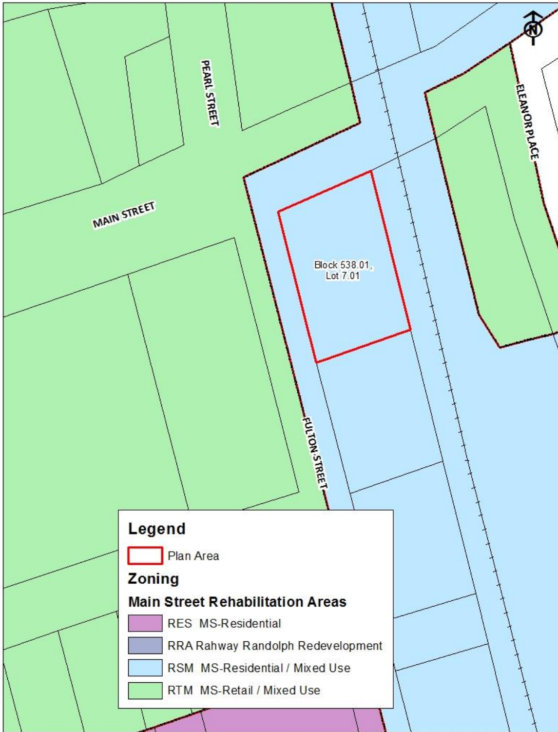
Figure 3: Existing Zoning