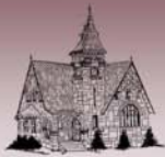
Exhibit Dates: April 30 - May 11, 2021 at

Eligible Art: oils; acrylics; watercolors; pastels; printmaking; drawings including graphite, pen & ink, chalk and charcoal; mixed media including collage; photography; sculpture & fine crafts.